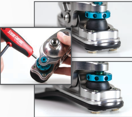
Adjusting the stride control up reduces heel resistance.

Stride Control allows for precise, incremental gait adjustments without any disassembly. Easily fine-tune the feel of the foot, increasing comfort and function for the user. A simple turn of a 4mm hex key changes the preload in the system for more or less resistance.