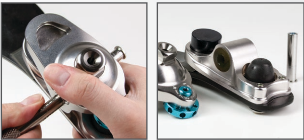
With only one pin to disassemble, the Venture requires minimal tools.

The Venture's bumpers and bushings can be swapped out as needed to increase and decrease resistance for a perfect feel. The bumpers were redesigned using aircraft-grade polymers for durability and longevity.